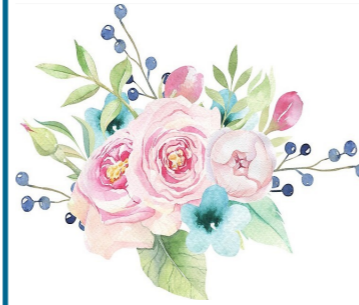
The Grand Estates on Greenwood