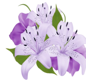
Colonial Square Senior Village