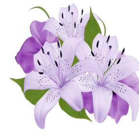
Maple Ridge Estates at Bedford

The Calamar Foundation partners with our local residents and our local chapters of the Alzheimer's Association, The American Cancer Society, and The American Heart Association to give back to the community in which we live and do business.